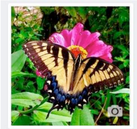
Spring Friends Meeting: The Art of Fearlessness - May 27, 2017

Quakers & the Arts A Continuing Discussion Selected Historical Quotes from Beyond Uneasy Tolerance A Collection of 100 Historical Quotes, published by The Fellowship of Quakers In The Arts, 1999 Many more of these quotes are online at: http://fqa.quaker.org/uneasy.html