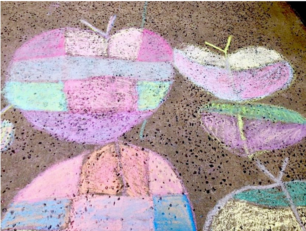
Chalk and Sidewalk Art