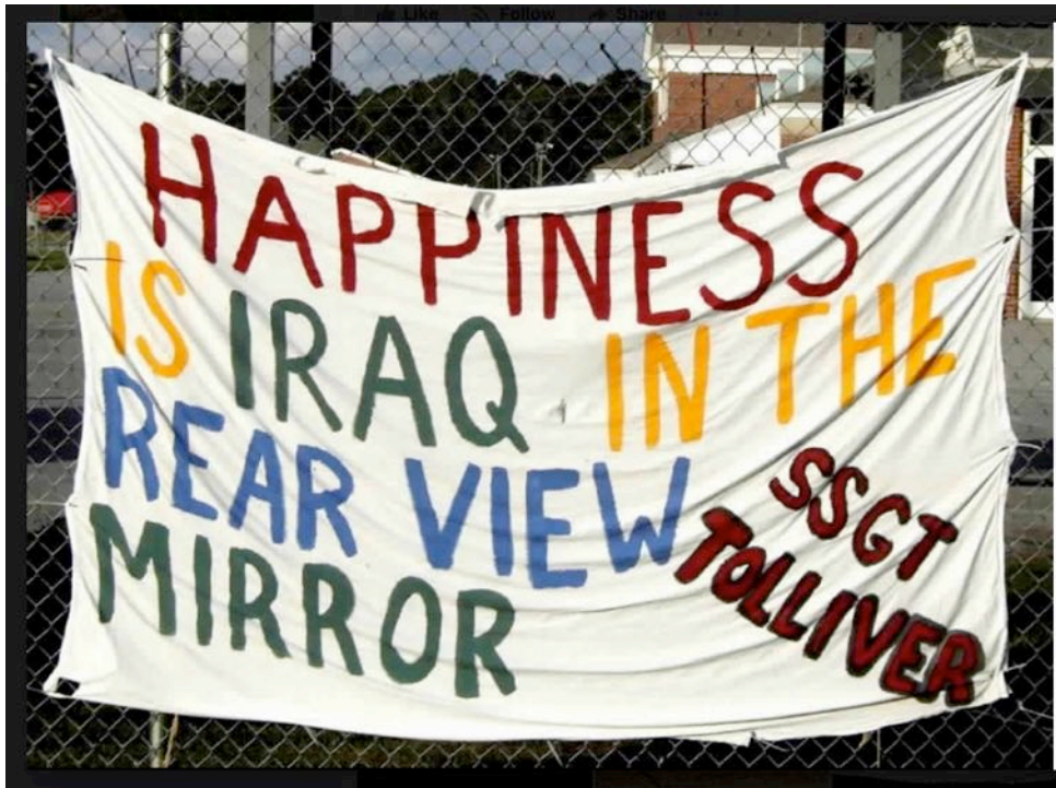
Homemade Banners Art